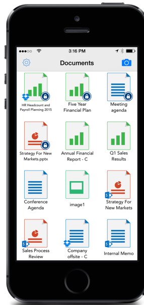
Secure document container

Your classification initiative is not complete if your users are not also classifying email on their smartphones and tablets. TITUS Classification for Mobile provides a secure and encrypted container for business information accessed from a mobile device and mitigates the risks associated with sharing emails and documents on a mobile device. TITUS Classification for Mobile ensures that the security, compliance and records management benefits of classification are shared with your mobile workforce.